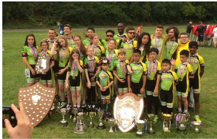
BIRMINGHAM WHEELS RSC 2019