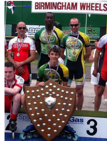
BIRMINGHAM WHEELS RSC 2010