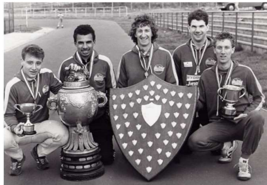
BIRMINGHAM WHEELS RSC 1987