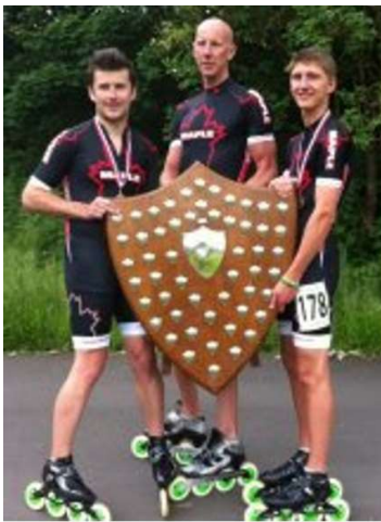
EAST MIDLANDS RACING 2012