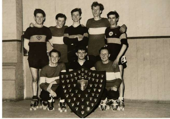
BIRMINGHAM RSC 1957