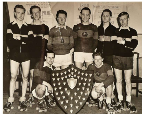
ALEXANDRA PALACE RSC 1953