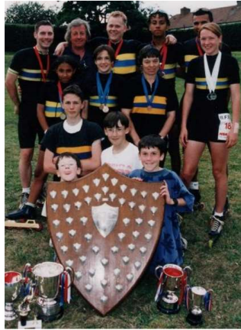
NORTH LONDON RSC 1998