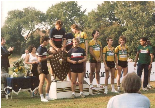
HERNE BAY FLYERS RSC 1985