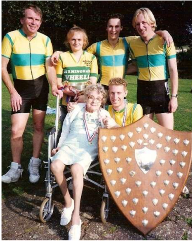
BIRMINGHAM WHEELS RSC 1992