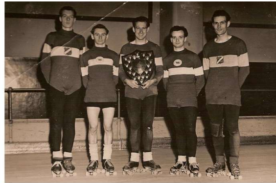
BROADWAY RSC 1950