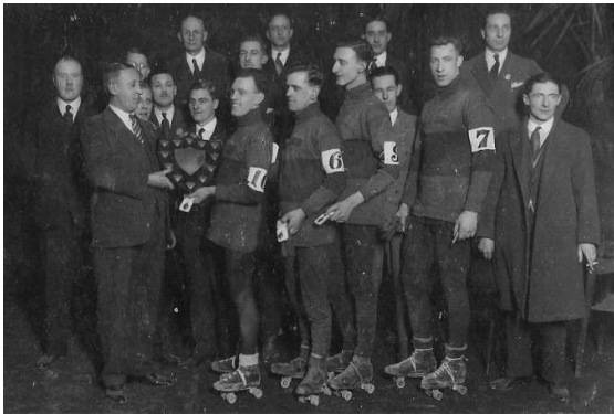
ALEXANDRA PALACE RSC 1930