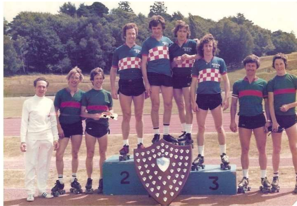
MERCIA RSC 1979