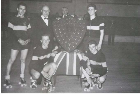
BIRMINGHAM RSC 1956