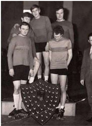
ALEXANDRA PALACE RSC 1971