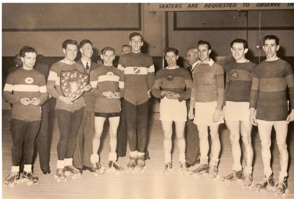
BROADWAY RSC 1950