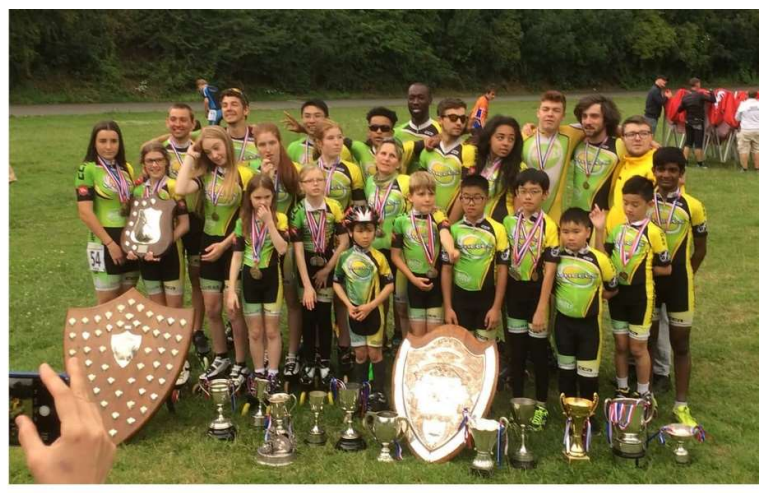
BIRMINGHAM WHEES RSC 2019