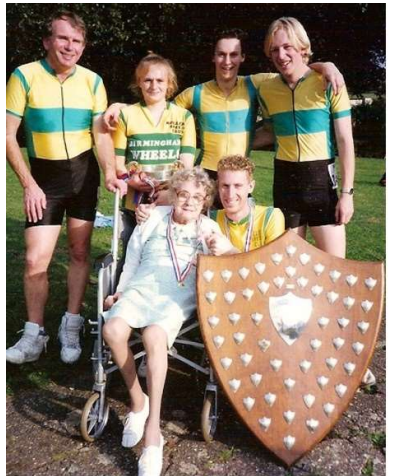
BIRMINGHAM WHEES RSC 1992