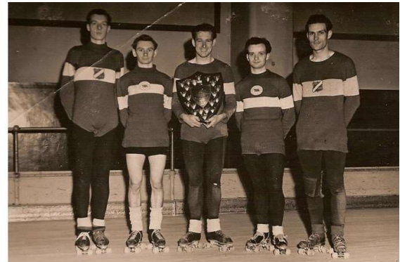
BROADWAY RSC 1950