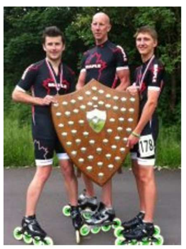
EAST MIDLANDS RACING 2012