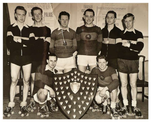
ALEXANDRA PALACE RSC 1953