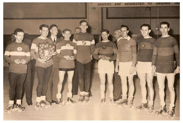
BROADWAY RSC 1950