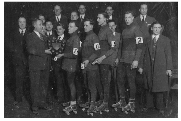
ALEXANDRA PALACE RSC 1930