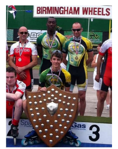
BIRMINGHAM WHEELS RSC 2010