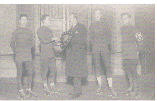
ALEXANDRA PALACE RSC 1929