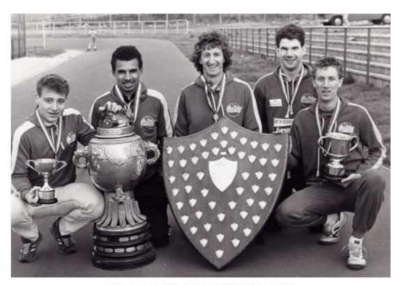
BIRMINGHAM WHEELS RSC 1987