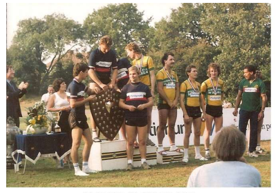
HERNE BAY FLYERS RSC 1985