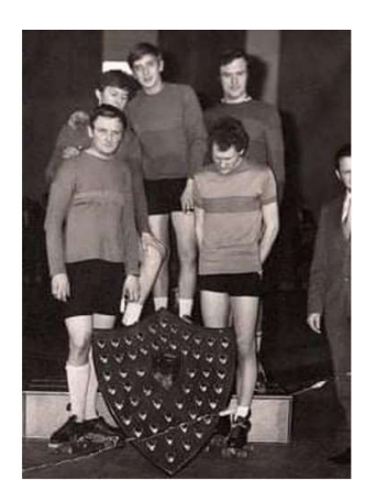
ALEXANDRA PALACE RSC 1971