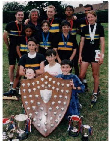
NORTH LONDON RSC 1998