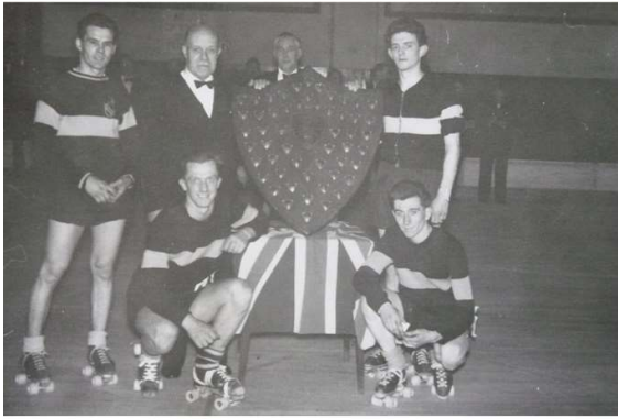
BIRMINGHAM RSC 1956