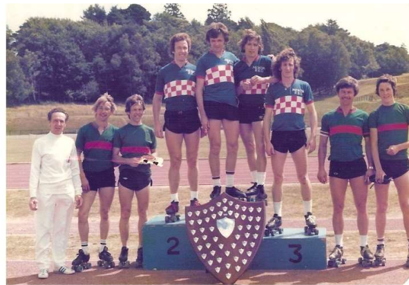
MERCIA RSC 1979