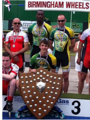
BIRMINGHAM WHEELS RSC 2010