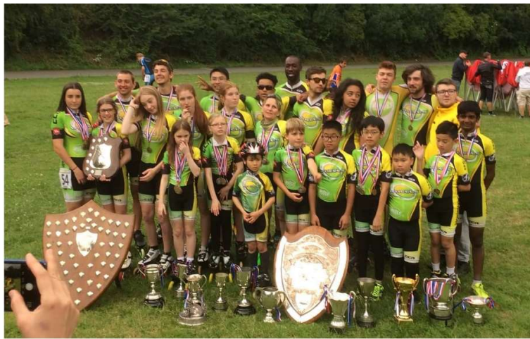
BIRMINGHAM WHEELS RSC 2019