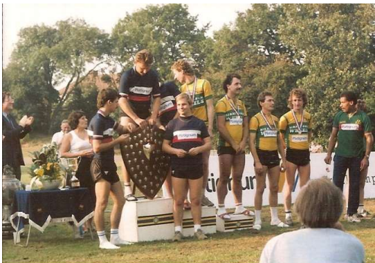
HERNE BAY FLYERS RSC 1985